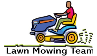
Lawn Mowing Team

A sign-up sheet has been placed on the CARE 2 board outside the Sanctuary.